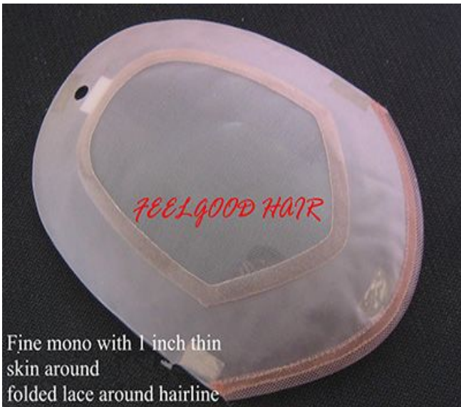
Fine mono with 1 inch thin skin around folded lace around hairline