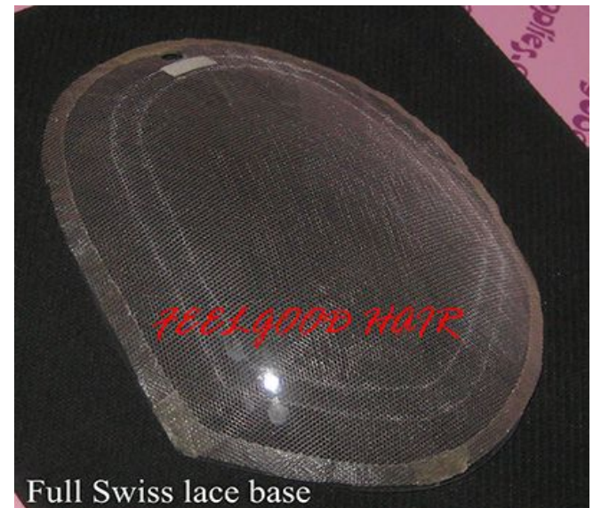
Full Swiss lace base