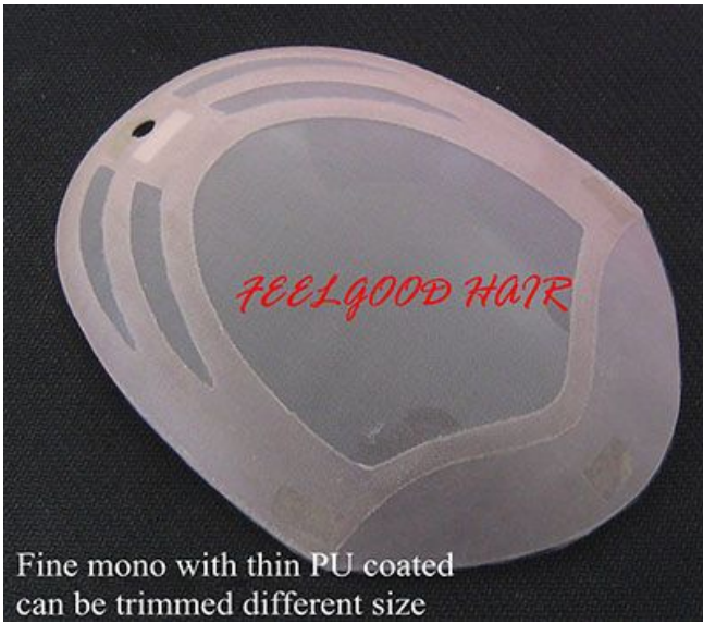
Fine mono with thin PU coated can be trimmed different size