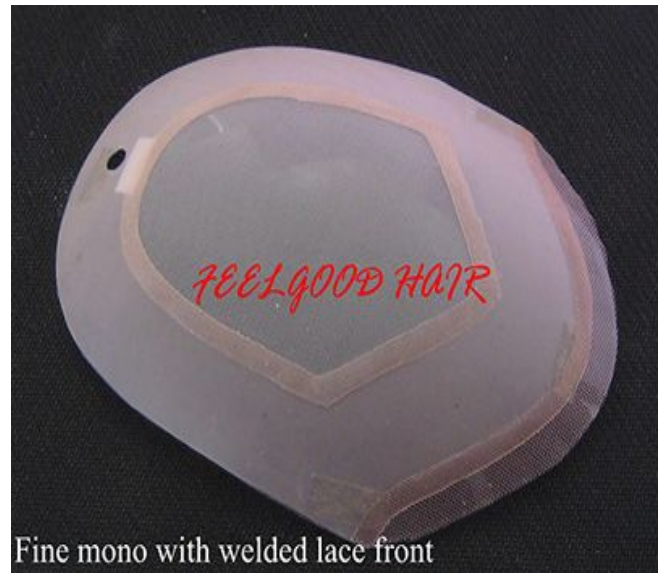
Fine mono with welded lace front