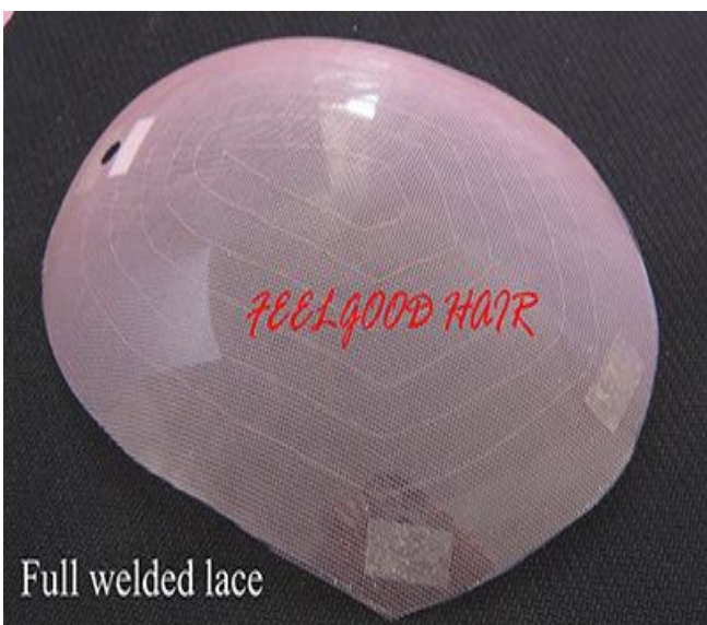
Full welded lace