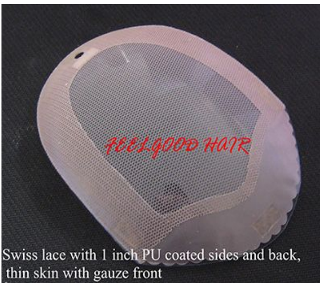
Swiss lace with 1 inch PU coated sides and back, thin skin with gauze front