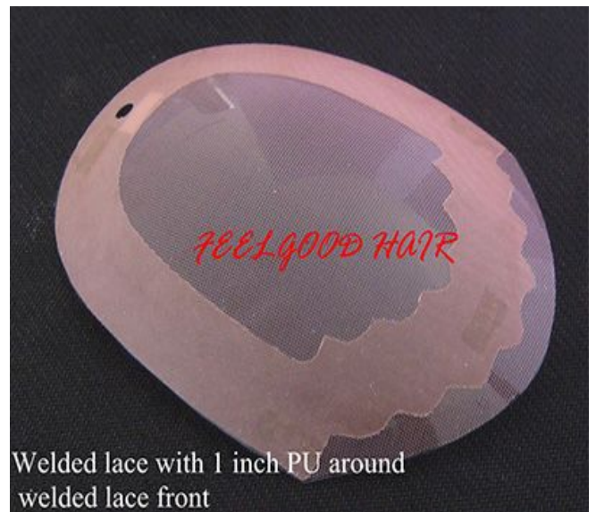
Welded lace with 1 inch PU around welded lace front