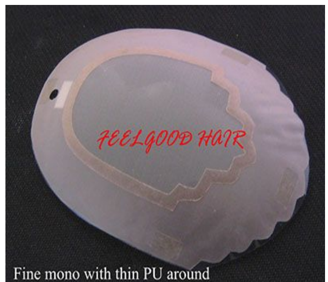
Fine mono with thin PU around