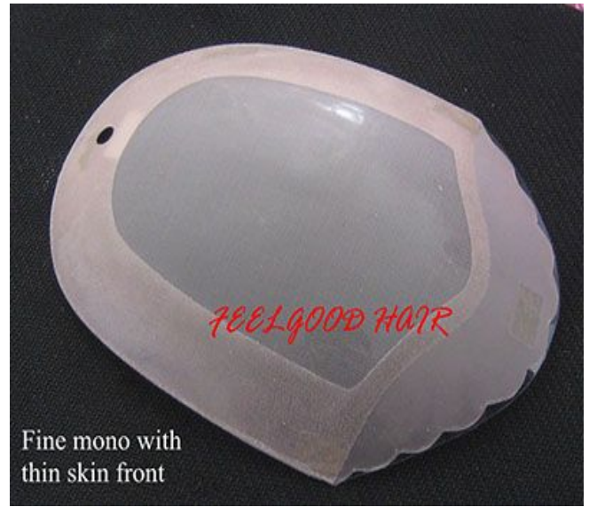
Fine mono with thin skin front