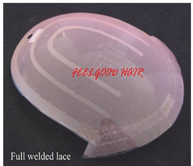
Full welded lace