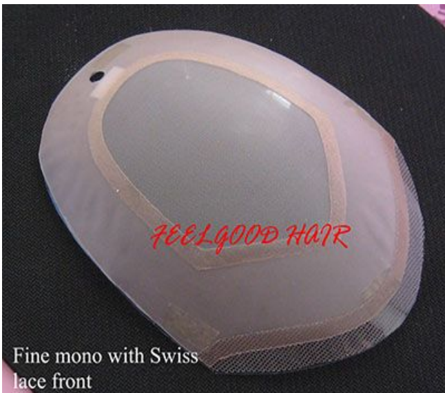
Fine mono with Swiss lace front