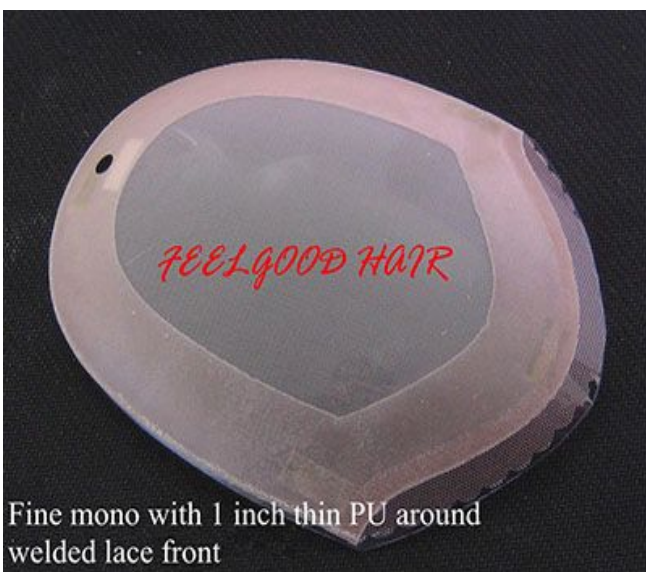
Fine mono with 1 inch thin PU around welded lace front