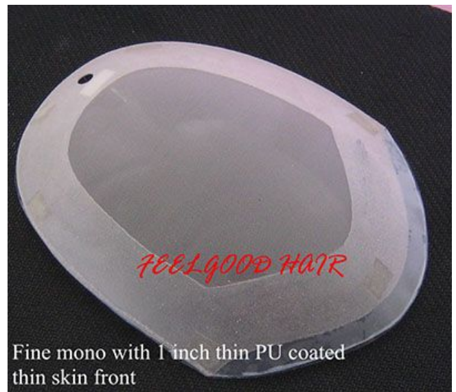
Fine mono with 1 inch thin PU coated thin skin front