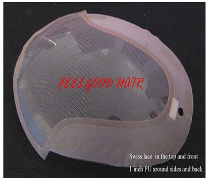
Swiss lace in the top and front 1 inch PU around sides and back