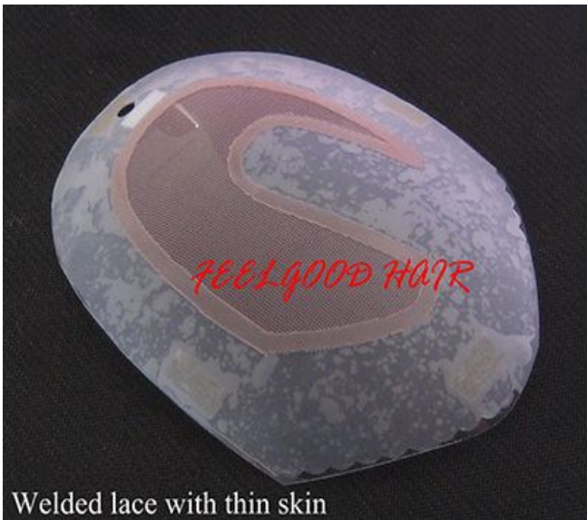
Welded lace with thin skin